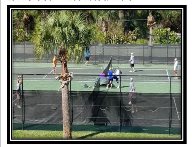
Tennis: 8:30 – 11:00 Tues & Thurs